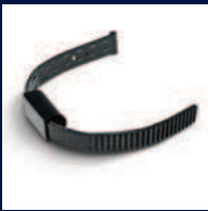
Ratchet strap with metal strap reinforcement (length 500 mm) for wide frames Art. no. 790-029