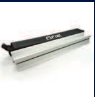
Drive-on ramp foldable Art. no. 790-019