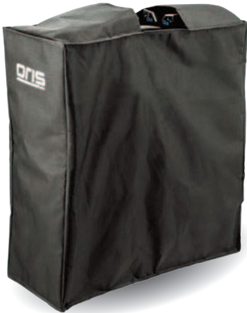
A high-quality storage bag is already included in the delivery.