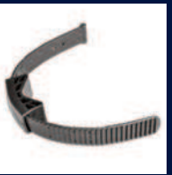
Tyre ratchet strap with metal band reinforcement (length 500 mm) with rim protector Art. no. 790-109