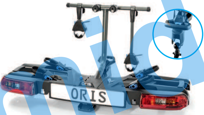
ORIS TRACC FIX4BIKE® Art. no. 710-002