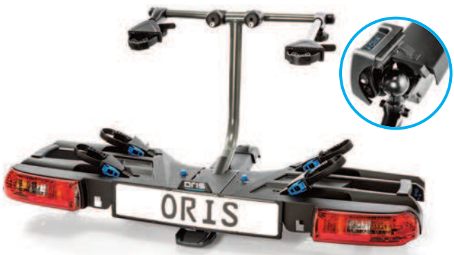
ORIS TRACC Art. no. 700-002