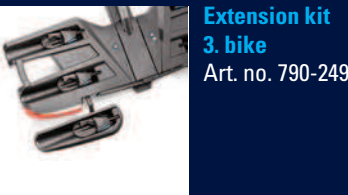
Extension kit 3. bike Art. no. 790-249