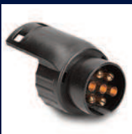
Adapter plug 7-13-pole Art. no. 023654