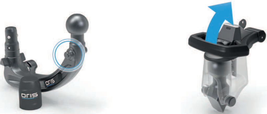
FIX4BIKE®-pins on the side of the towball neck: the unique positioning aid

Like all conventional carrier systems, the ORIS TRACC is mounted in a few simple steps using a standard quick-release fastener. With the patented FIX4BIKE®-version, only one movement is required to mount or dismount the system. The ORIS TRACC FIX4BIKE®-bike carrier, which is suitable for all FIX4BIKE®-towbars, is positioned above the towball and then simply lowered until it audibly clicks into place automatically, securely and safely. This bike carrier benefits from the clever concept of the FIX4BIKE®-towbar. The forces that occur are not only transmitted via the towball, as is the case with conventional clamping systems, but to a large extent via two special pins, called FIX4BIKE®-pins, which are located on the sides of the towball neck. While the ORIS TRACC FIX4BIKE®-bike carrier only fits on a FIX4BIKE®-towbar, the FIX4BIKE®-towbar is compatible with all standard towbar mounted bike carriers.